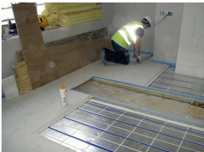
Fermacell flooring elements being installed using glue and diverging staples.