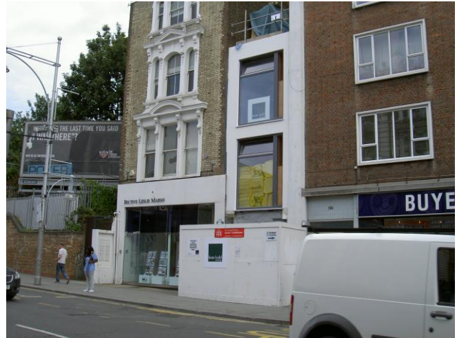
When there is a will there is a way; Notting Hill Prep. School entrance squeezed in between two existing buildings.